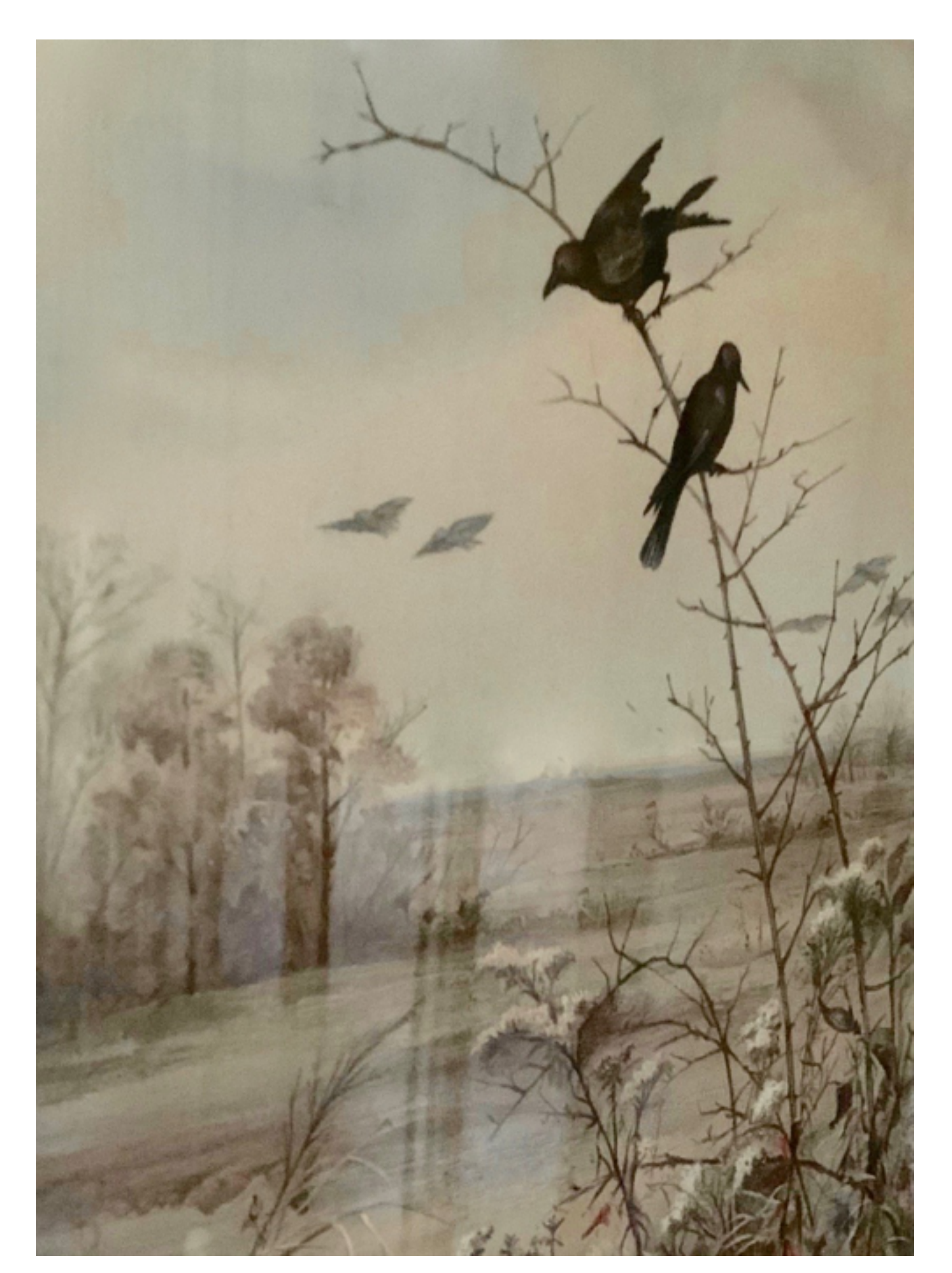
November print from the Willard House Dining Room