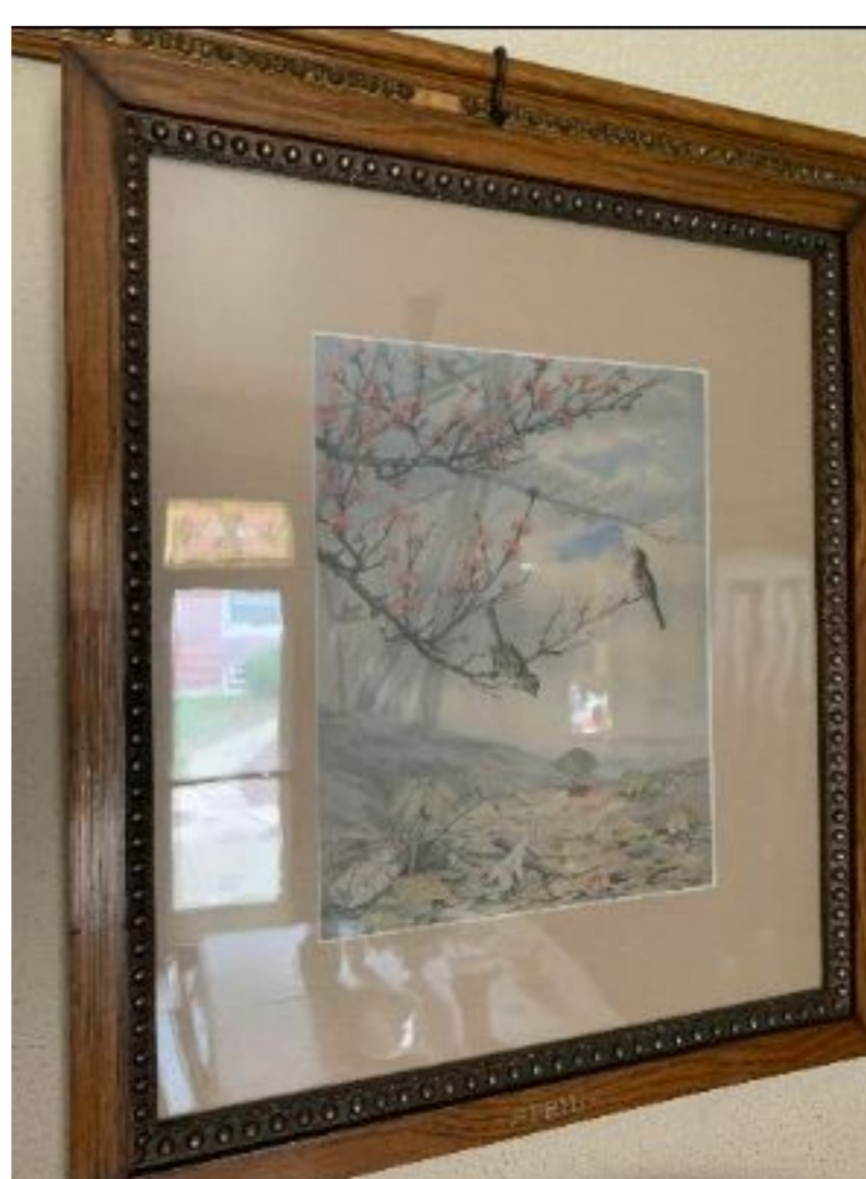
April print from the Willard House Dining Room

Visit our website for updates and lots more. You can find us online on Facebook, Twitter and Instagram - links below.