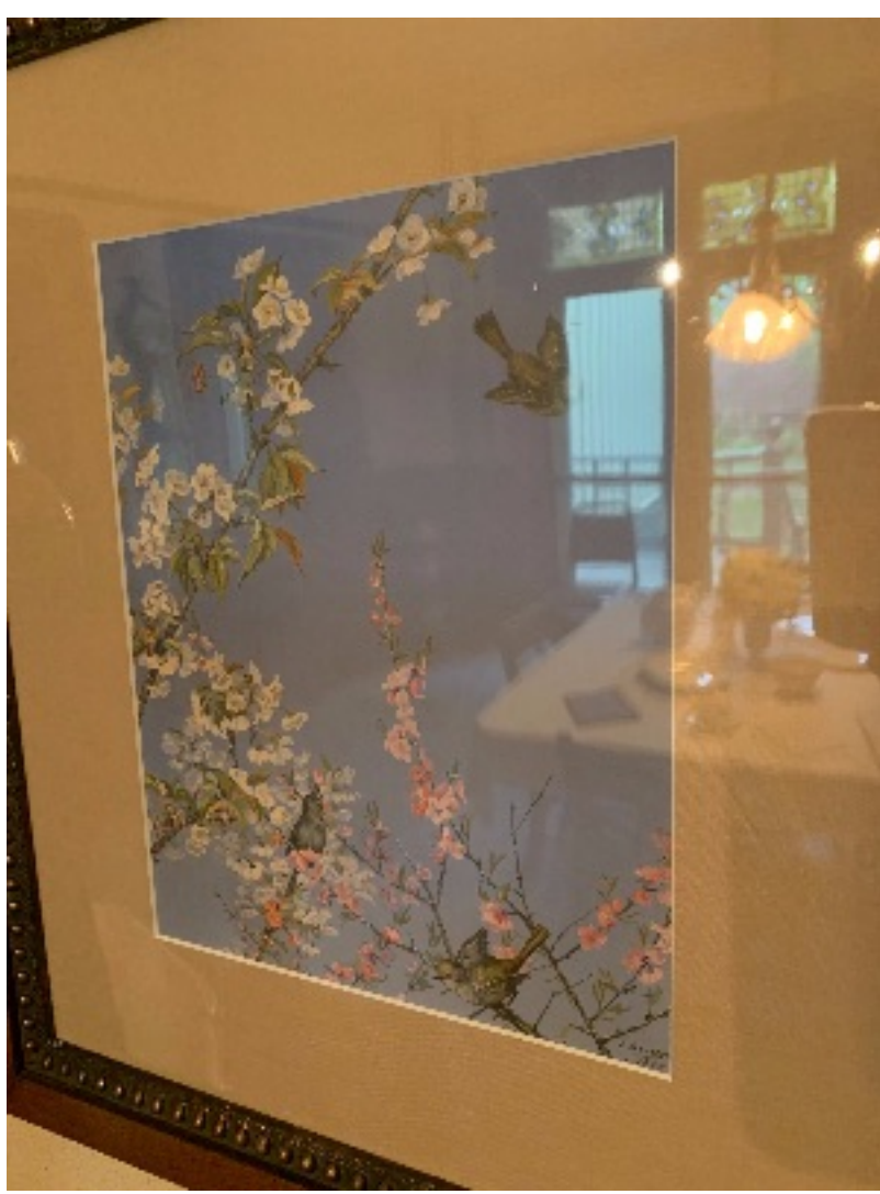
May print from the Willard House Dining Room

Visit our website for updates and lots more. You can find us online on Facebook, Twitter and Instagram - links below.