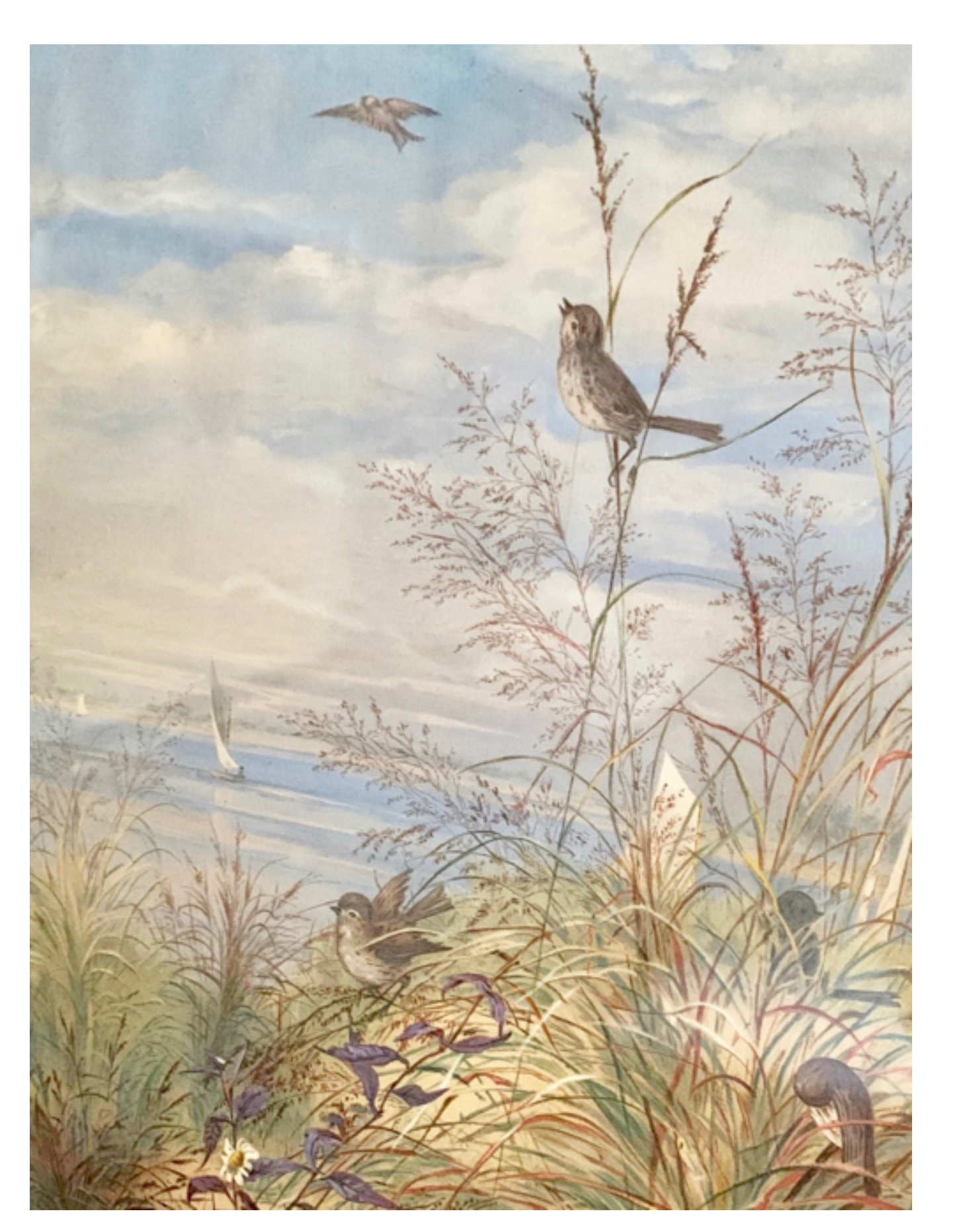
September print from the Willard House Dining Room